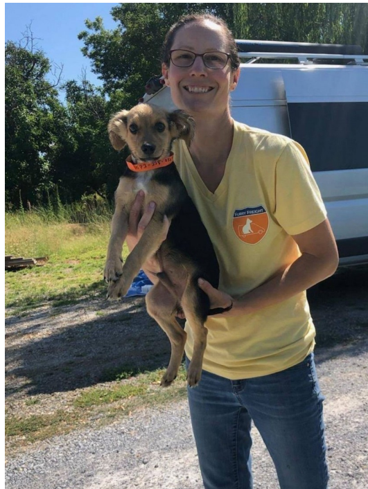
Kim and Frappe- Transported 8/4/19